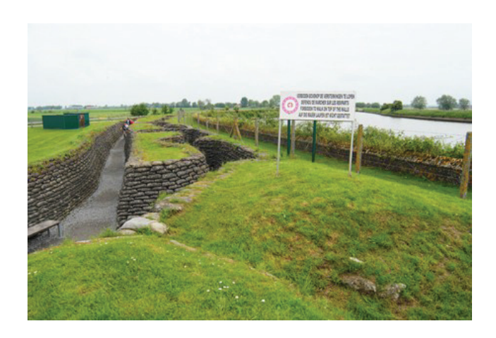
Fig. 1 - The Trenches of Death (Boyau de la Mort, Dodengang), near Dixmude (Belgium). The level of the water table impeded digging, and trenches were raised by piling sandbags.

After the Battle of the Marne, where the Allied forces took advantage of the Tertiary cuesta of the Île-de-France and the valleys of the river Marne and its tributaries, the front was stabilized, and the trench warfare began.