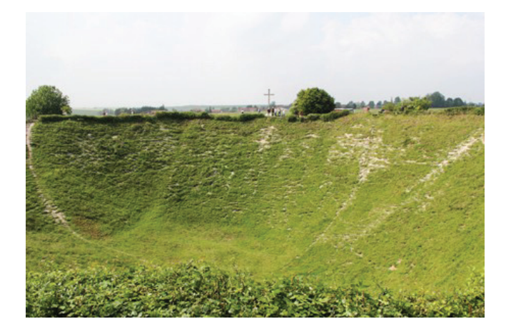
Fig. 4 - Le Lochnagar Crater (Somme). The Lochnagar mine (27 tons of ammonal) was sprung at 7:28 a.m.on 1 July 1916, the first day of the Battle of the Somme.

These factors controlled the type and quantity of timbering that was required. For instance, the highly fractured Bajocian limestone of Lorraine required heavy timber, as dugouts in the sandstone or granite of the Vosges did not need any timbering.