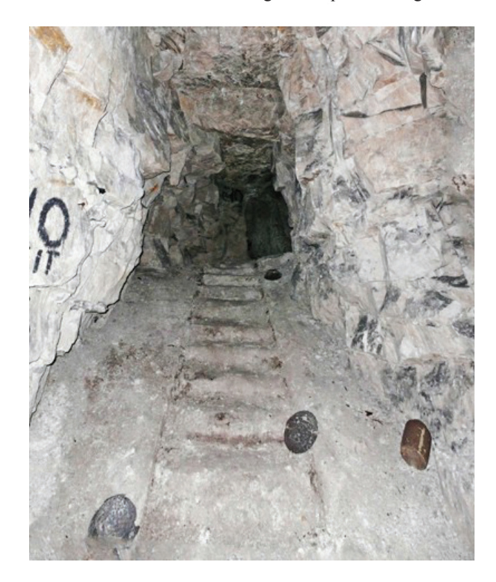
Fig. 5 - Arras (Pas-de-Calais), Carrière Wellington. A way out leading to the front.

In Arras, to prepare the offensive of 1917, the British forces decided to re-use the old underground quarries dug in the