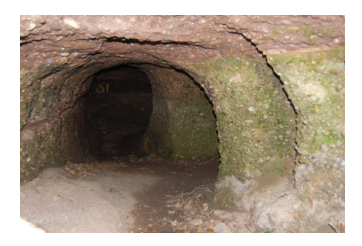
Fig. 2 - La Chapelotte (Vosges). A shelter in the Vosges sandstone (Middle « Buntsandstein »).